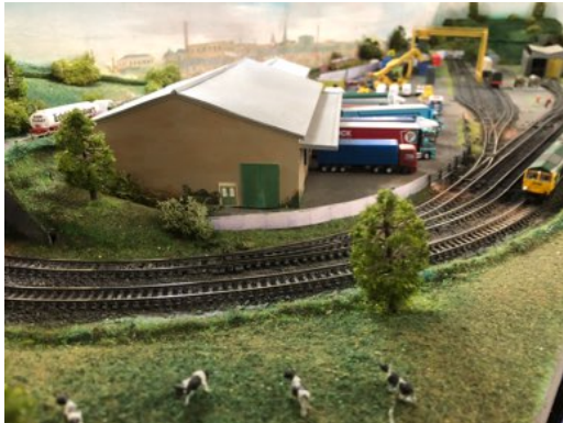
Keep the interest up.....