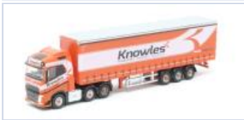
NVOL4003 Volvo FH4 curtainside "Knowles"