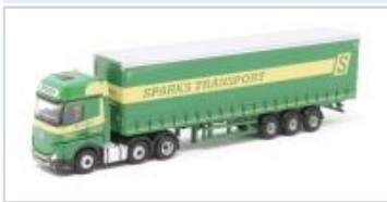
NMB006 Mercedes Actros curtainside - "Sparks Transport"