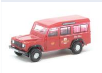
NDEF002 Land Rover Defender Royal Mail