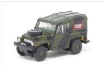
NLRL002 Land Rover Lightweight Military Police