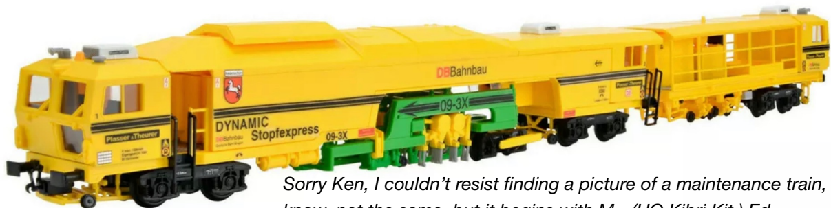
Sorry Ken, I couldn't resist finding a picture of a maintenance train, I know, not the same, but it begins with M - (HO Kibri Kit ) Ed

Whilst running it in, my thoughts turned to extra vehicles, sadly there are none available as ready to run units. Although there are plenty of used coaches available at sensible prices. After acquiring these I completed a repaint using the nearest colour match available.