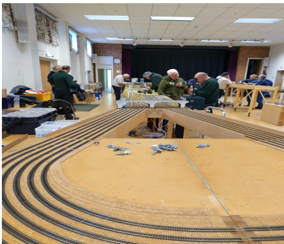
Here are a couple more shots of their N Gauge Modular Layout.