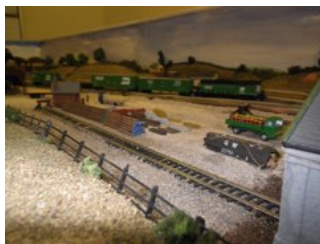
Areas of Waterstock not normally photographed.